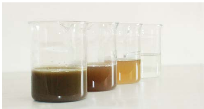
The solid matter of the liquid manure is separated from the water in four process steps. The result: Water, nutrient concentrate and dry fertilizer.

(*Studies conducted by Wageningen University back in 2011 had delivered similar results.)